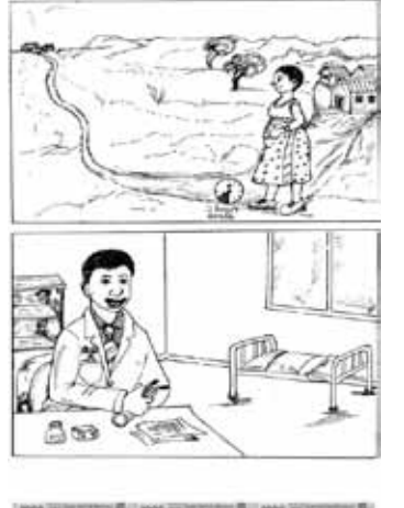
Figure 2. Examples of ranking cards